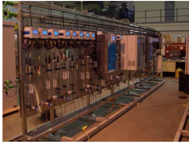
Steam - Water Sampling