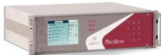
Inert Gas Monitoring

Richmond System Technologies Ltd 34 Highfield Avenue Appleton Warrington WA4 5DU